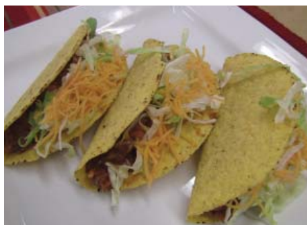
Pinto Bean Beef Tacos Page 74