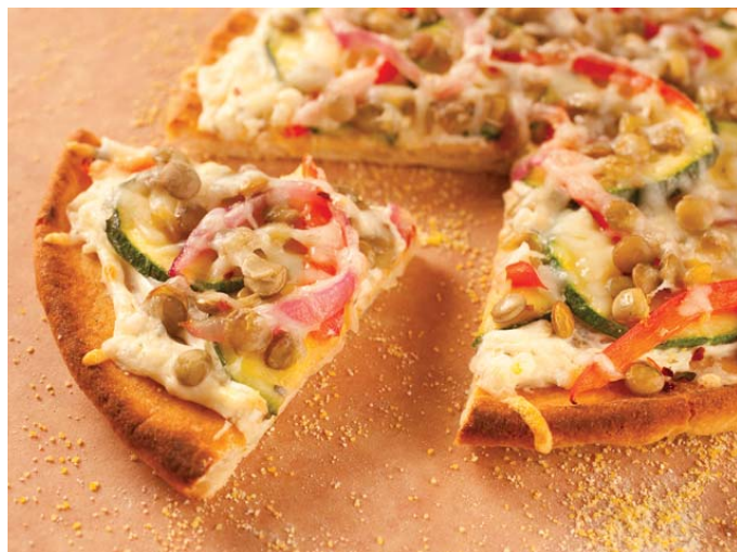
Lentil (or Black Bean) Mini Pizzas Page 31