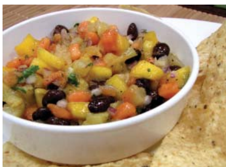
Black Bean and Fruit Salsa Page 19