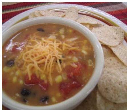
Microwave Chicken Tortilla Soup Page 49