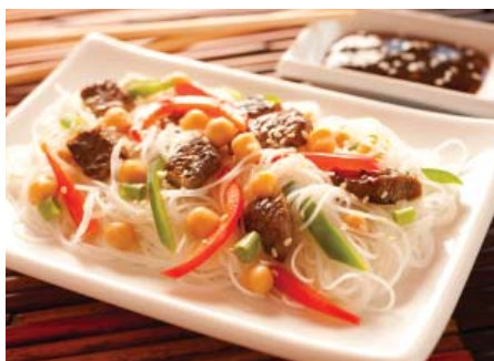
Steak and Chickpea Stir-Fry Page 78