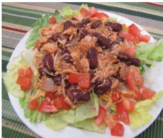
Tex-Mex Chicken and Bean Salad Page 38