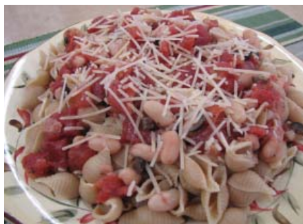
White Beans and Pasta Page 80