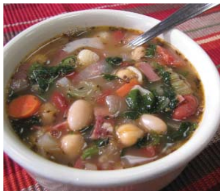
Rainbow Stew Page 51