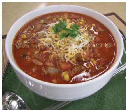
Pinto Bean Taco Soup Page 50