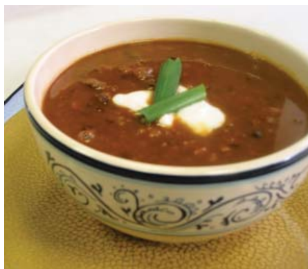
Sweet Potato Black Bean Soup Page 54