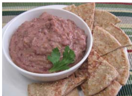
Green-Chili Bean Dip Page 23