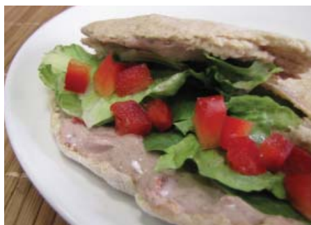
Black Bean Sandwich Spread Page 21