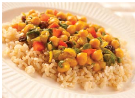
Chickpea and Spinach Curry Page 69