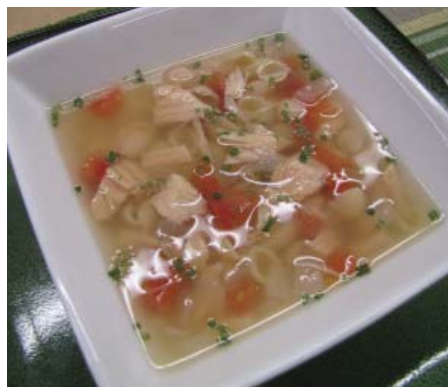
Back to School Pasta Soup Page 43