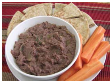
Black Bean Dip Page 20