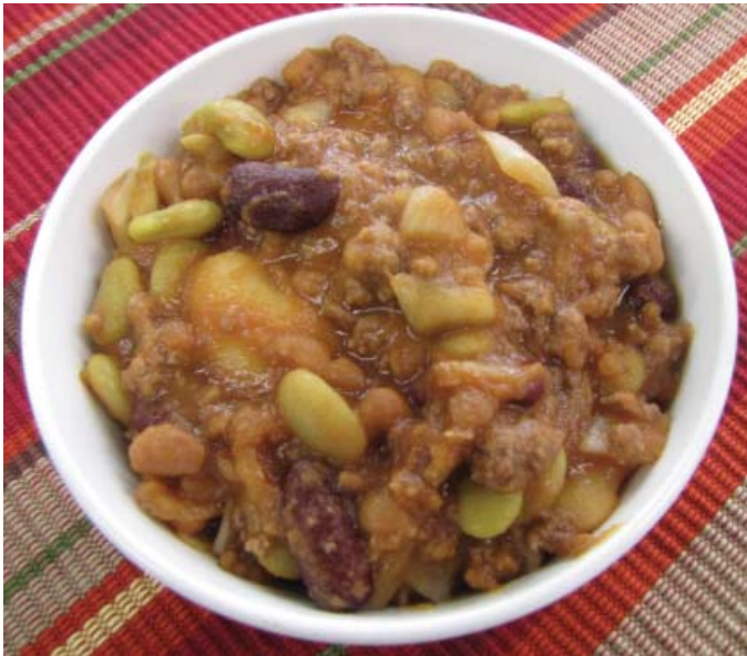
Cowboy Beans Page 61