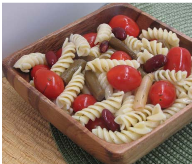
Three-Bean Pasta Salad Page 39