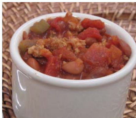
Turkey and Bean Chili Page 56