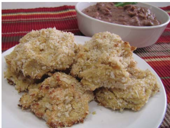
Hummus Dippers Page 30