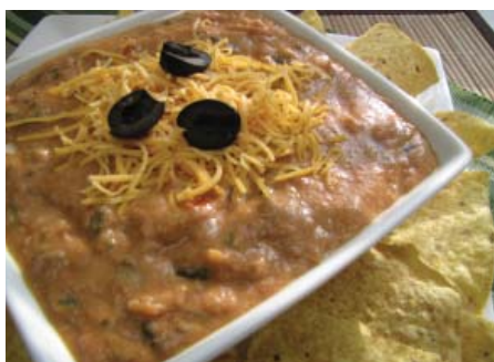
Aribe Nacho Dip Page 19