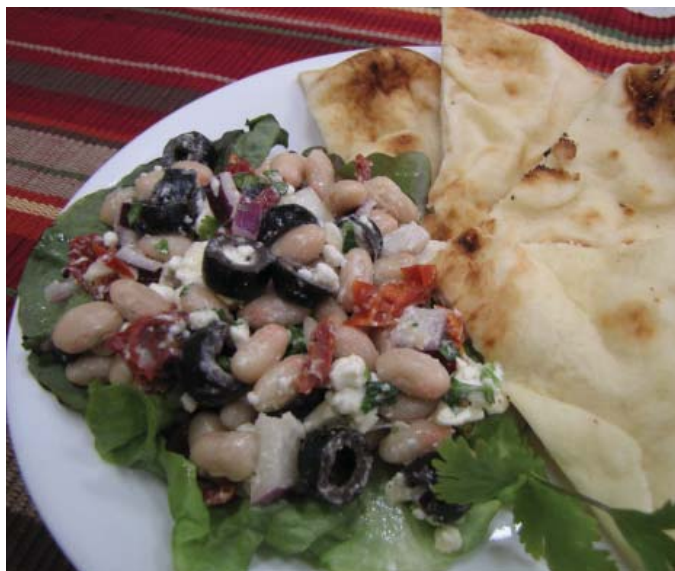
Mediterranean Bean Salad Page 37