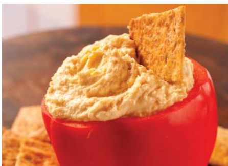
Hummus Page 24