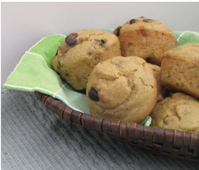
Chocolate Chip Bean Muffin Page 16