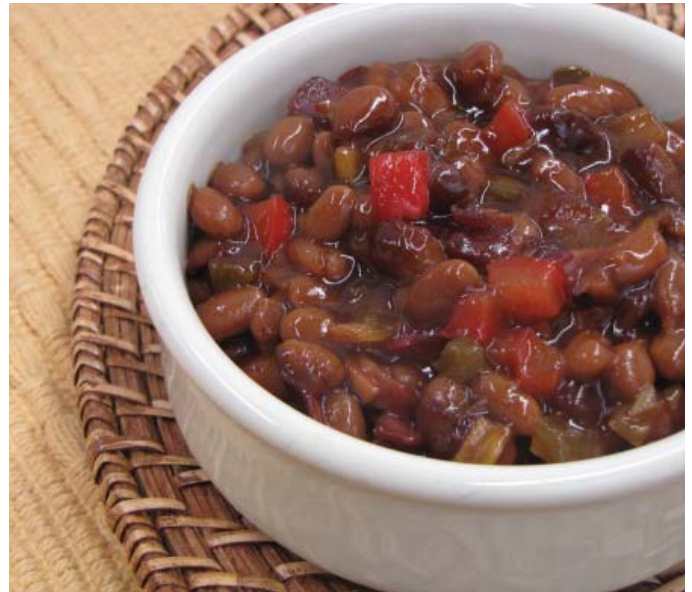
Sizzlin' Baked Beans Page 64