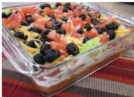
Layered Bean Dip Page 24