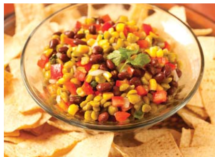
Split Pea Salsa Page 25