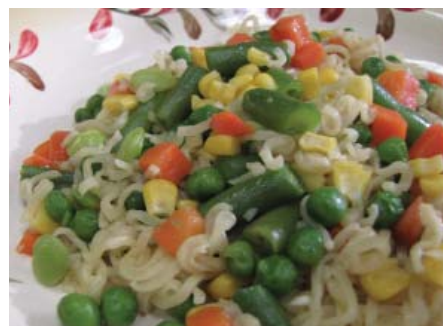
Ramen Noodle Casserole 2 Page 75