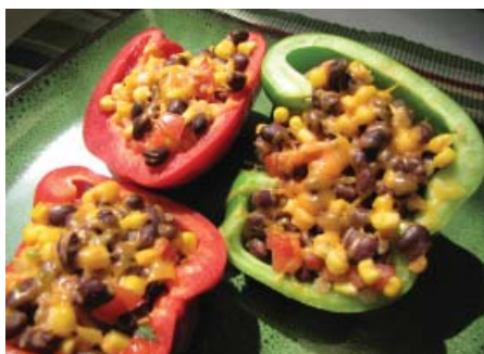
Blazin' Stuffed Peppers Page 68