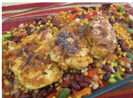
Blackened Chicken and Beans Page 68