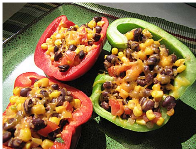
NDSU Extension Service

Makes eight servings. Per serving: 170 calories, 3 g fat, 13 g protein, 23 g carbohydrate, 7 g fiber and 300 mg sodium