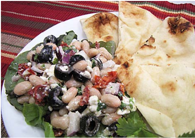
NDSU Extension Service