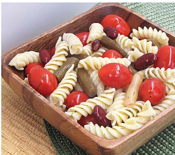
NDSU Extension Service

Makes 12 servings. Per serving: 100 calories, 1.5 g fat, 5 g protein, 19 g carbohydrate, 4 g fiber and 360 mg sodium