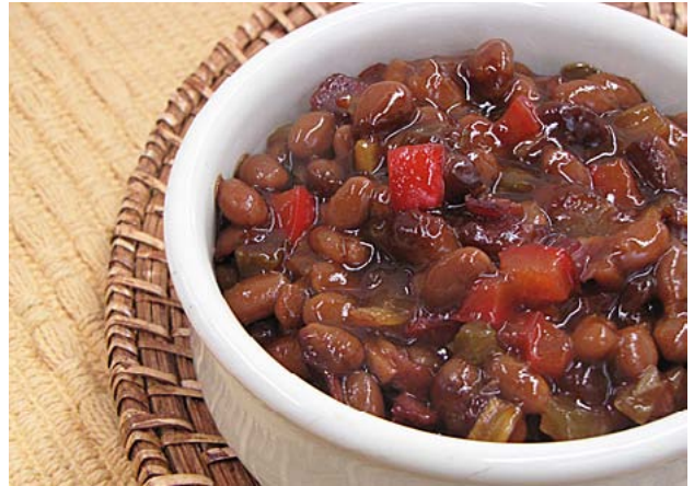
NDSU Extension Service

Makes six servings. Per serving: 150 calories, 7 g fat, 5 g protein, 16 g carbohydrate, 5 g fiber and 200 mg sodium