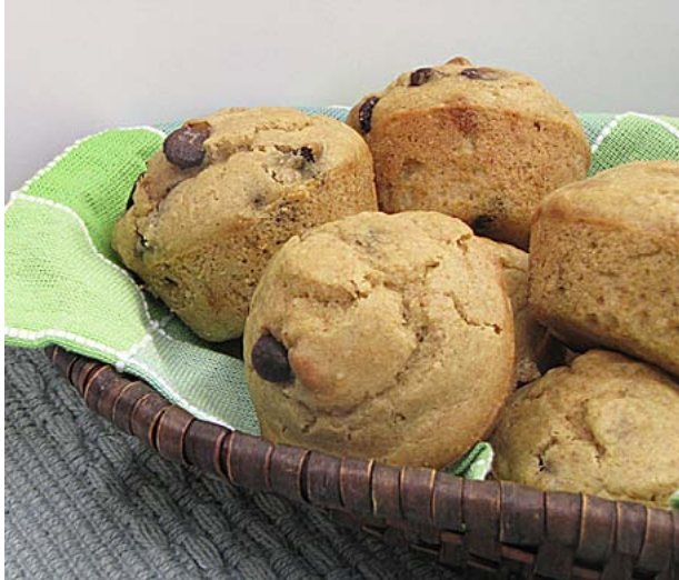
NDSU Extension Service