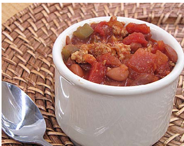
NDSU Extension Service